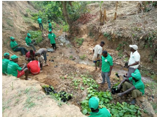
Plant Nursery operations in progress