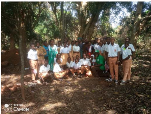
Above: Engagement of Conservation Club Members in Schools