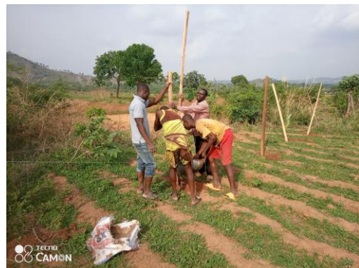
Fencing of the planting site