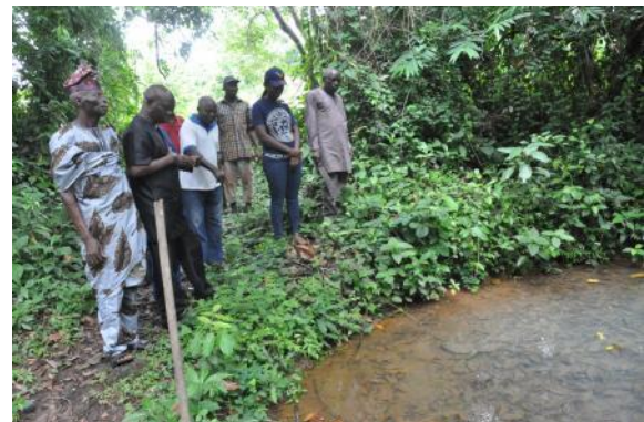
A perennial spring water site inside the Community Forest