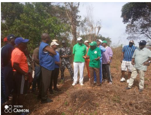
Community tour of the project site led by the King in December 2022