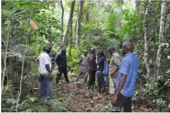
A location Inside the Otun Community Herbal Heritage Forest