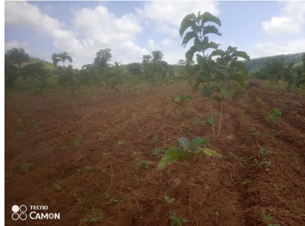
Site visit to the Community Woodlot in Shishipe Village