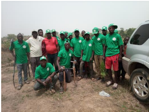
The Community Green Ambassadors

The Company, in collaboration with the Great League of Pioneers for Community Sustainable Development (GLOP-CSD), has also facilitated the establishment of a Community Woodlot and Plant Nursery in Shishipe Village, Off Mpape, in Bwari Area Council of Abuja, FCT. The project is being driven by the Community Youths constituted as Community Green Ambassadors by ENARMAC Nigeria Limited while also engaging in other community engagement activities.