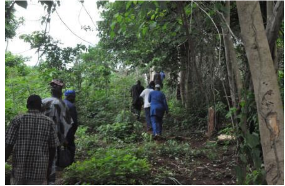
Another location inside the Otun Community Herbal Heritage Forest

The Company, in collaboration with the Great League of Pioneers for Community Sustainable Development (GLOP-CSD), has also facilitated the establishment of a Community Woodlot and Plant Nursery in Shishipe Village, Off Mpape, in Bwari Area Council of Abuja, FCT. The project is being driven by the Community Youths constituted as Community Green Ambassadors by ENARMAC Nigeria Limited while also engaging in other community engagement activities.