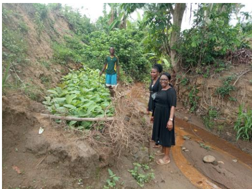
The blooming seedlings