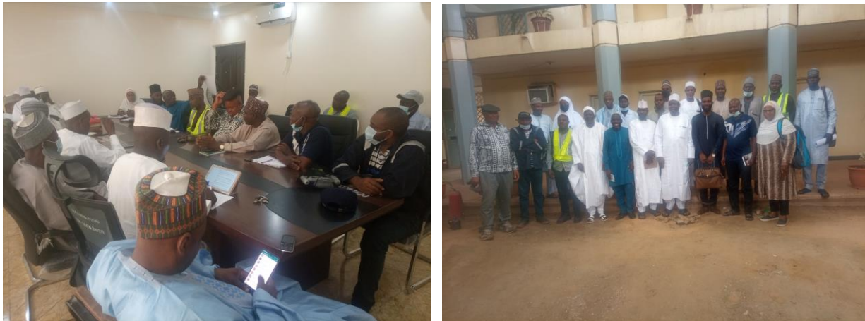
Briefing session with various stakeholders during the EIA studies in Sokoto State (2021).

The process was commenced in September 2021 and completed in March 2022. The EIA process included series of stakeholder's engagement, data collection on environmental and social parameters in the project locations, data analysis and comprehensive report writing to identify likely impacts and propose mitigation measures for acceptable project implementation plan.