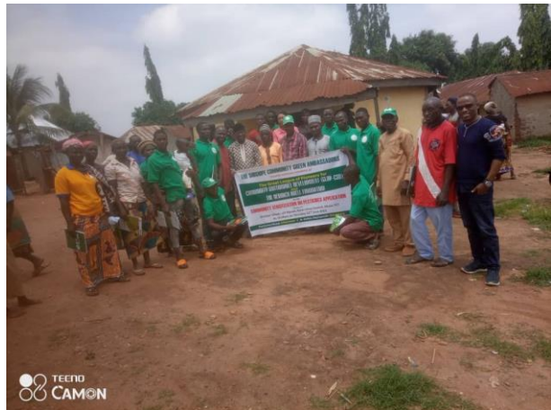
Above: A Stakeholder engagement on the safe use of agrochemicals in Shishipe Village, off Mpape, Bwari Area Council, Abuja, FCT on 22 nd June 2023 in collaboration with GIZ Boell Foundation.