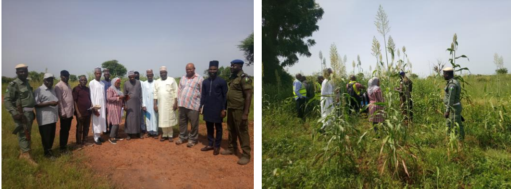
Above: Engagement with stakeholders during data collection for ESIA on development projects in Sokoto State in September 2021.

The projects are aimed at expanding the scope of socio-economic development in Sokoto State. After the development of concept notes for the various projects, our partner Organization, Carter Consulting Limited embarked on the production of feasibility studies for the projects while ENARMAC Nigeria Limited was commissioned to undertake the Environmental Impact Assessment (EIA) of the projects.