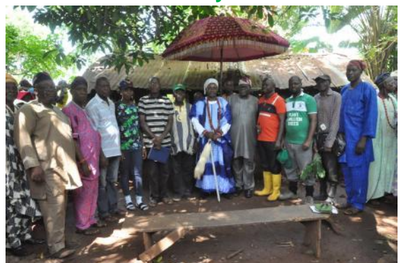
The King with the Technical Team from Federal Min. of Environment in 2017